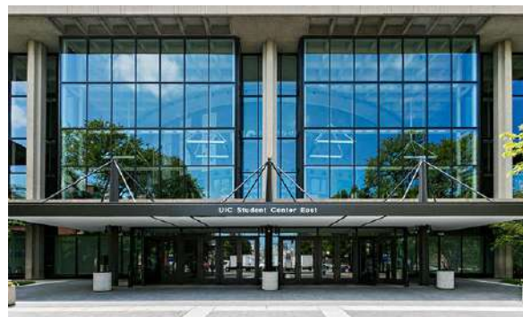
UIC Student Center East